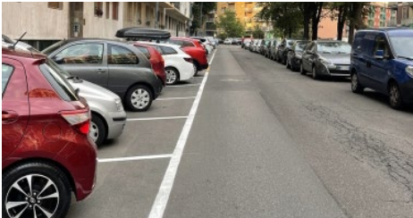
Free parkings (white lines)