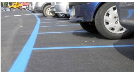
To pay parkings (blue lines) Becomes free at night